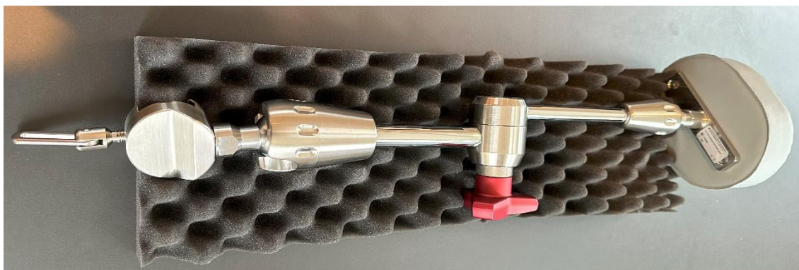
Opitek Flex Fix model with re-usable pad