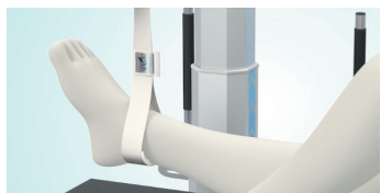
LIFTING STRAP 2006-50