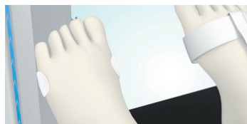
ADHESIVE VELCRO COIN 2006-65

For forefoot & finger lifting. Non allergenic.