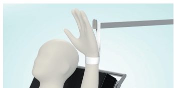
LIFTING STRAP 2006-60

Supports: arm, fingers, forefoot and ankle.